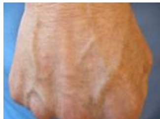
Hand after 4 treatments