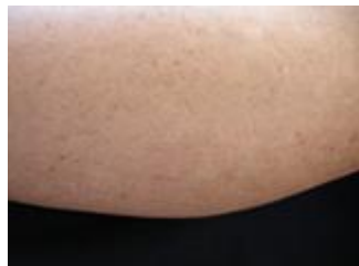
Leg after 4 treatments