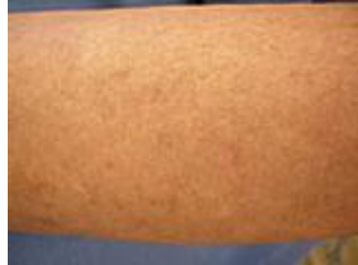
Arm after 4 treatments