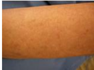
Forearm after 4 treatments